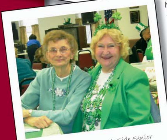
Two members of the South Side Senior Center celebrate St. Patrick's Day. The center hosted live music, food and dancing throughout the day.