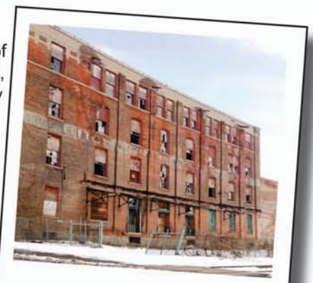
The Hitchner Biscuit Company building as it stands in its current state. The property will be turned into affordable housing by UNCCDC with 18 apartment units.