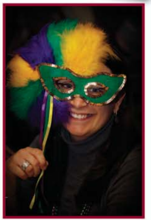
A guest shows off her festive Mardi Gras mask.