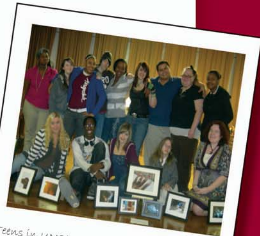
Teens in UNC's photography program hosted an exhibit and spaghetti dinner fundraiser at the West Side Senior Center. The group raised over $300 to put towards a trip to Washington, D.C.