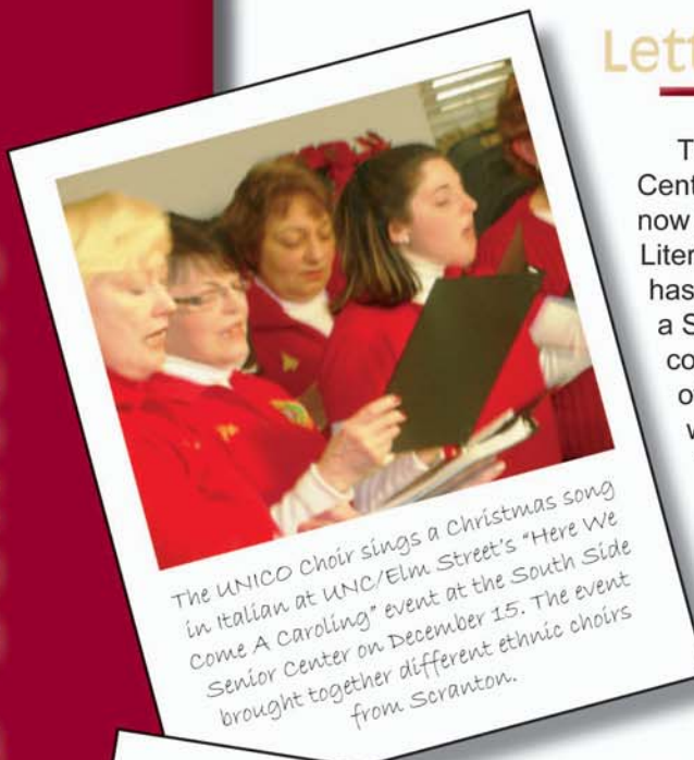
The UNICO choir sings a Christmas song in Italian at UNC/Elm Street's "Here We Come A Caroling" event at the South Side Senior Center on December 15. The event brought together different ethnic choirs from Scranton.