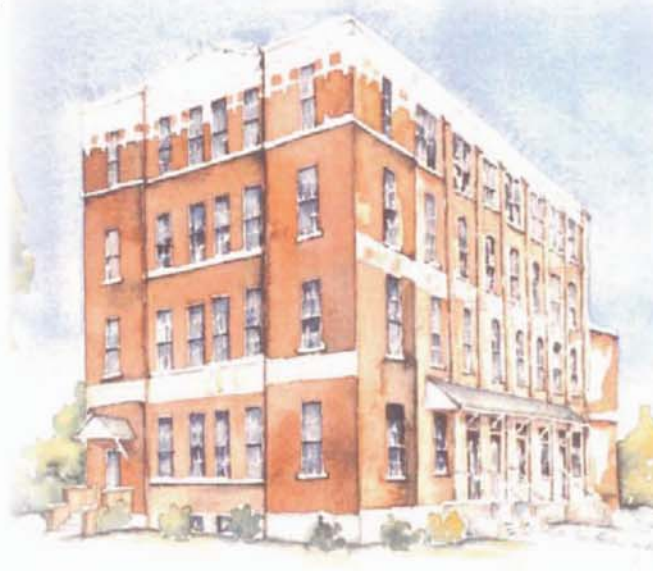
An architect rendering of what the former Hitchner Biscuit Company property in West Pittston will look like when UNCCDC's construction is complete in 2012.

GKH Consulting Company, as well as UNCCDC, which will act as the Developer/Management Agent. Construction is expected to begin in Spring 2011.