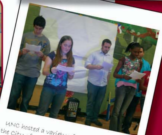
UNC hosted a variety of activities as part of the City of Scranton's MLK Day. Members of UNC's Youth Performance Troupe performed a skit about segregation and Jim Crow laws.