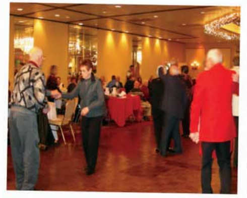
The older adults from UNC's four senior centers- Mid Valley, Carbondale, South Side and West Side- came together for a day of dancing and fun with their families for their first annual Christmas Celebration.