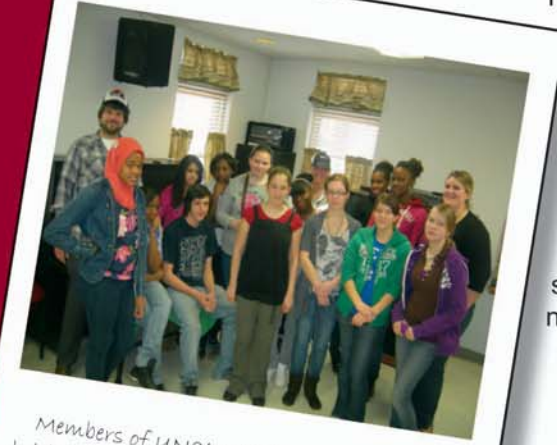
Members of UNC's Leaders in Training held a pancake breakfast on February 26 to raise money for their scholarship fund and graffiti prevention program.