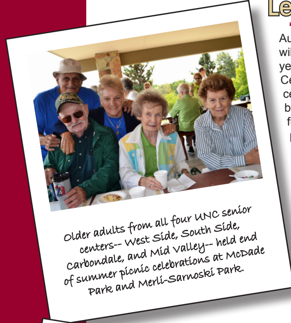
Older adults from all four UNC senior centers-- West Side, South Side, Carbondale, and Mid Valley-- held end of summer picnic celebrations at McAdams Park and Merli-Samoski Park.