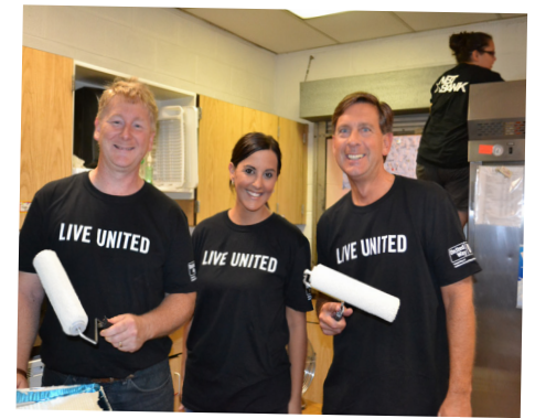
In September, UNC once again participated in the United Way's annual Day of Caring event by hosting over 75 volunteers who spent the day painting, helping pack storage, and interacting with youth and seniors.