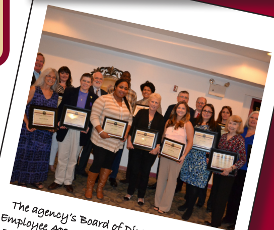
The agency's Board of Directors hosted an Employee Appreciation Dinner at the Melting Pot in October to honor UNC employees who have attained milestone service dates-- two staff have 25 years of employment!