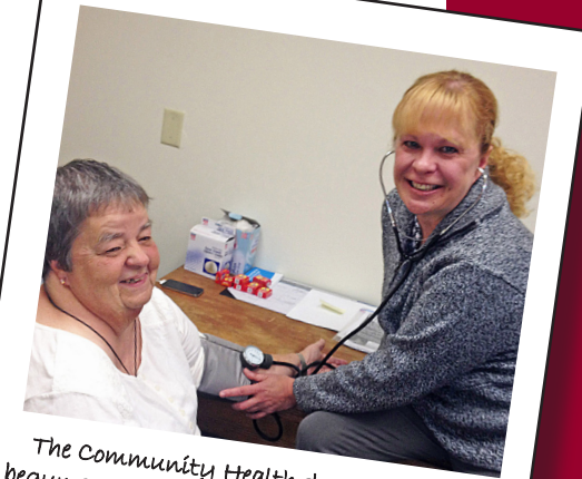
The Community Health department has begun a Cardiovascular Awareness Program for older adults thanks to a grant from the Blue Ribbon Foundation. Additionally, Peer Health Educators have been trained and are beginning to work in the community.

Save the date for the agency's 15th Annual Mardi Gras Celebration which will be held on Friday, February 6, 2015 at the Radisson Lackawanna Station from 6-10 p.m. As usual expect fun including casino gaming, fortune tellers, New Orleans cuisine and much more! Ticket information coming soon and they will be available for purchase online at UNC's website.