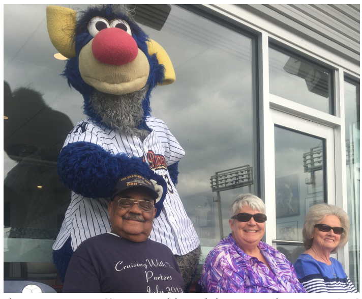
This summer, UNC's active older adults enjoyed a trip to PNC Field, where they had the opportunity to meet Champ, the Rail-Riders mascot.