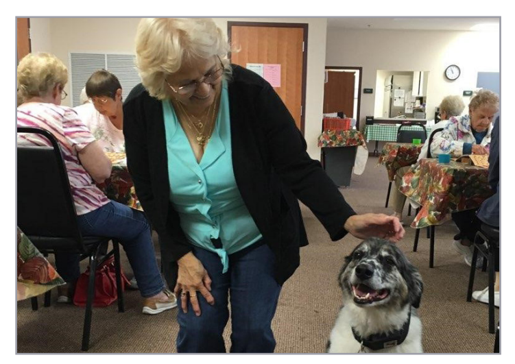
Counseling services are being offered to those who may be the hardest to reach, or those who have difficulty accessing other services throughout the area. The CHD has even added pet therapy to the unique service lineup.

In 2014, UNC created its Community Health Department (CHD) as a bridge to connect health care and social services, with the goal of improving health outcomes for at-risk individuals. The primary service provided is one-on-one care coordination. The CHD also takes an active role in coordinating health education and outreach programming, screenings, and clinics targeted to reach a broader audience of at-risk individuals.