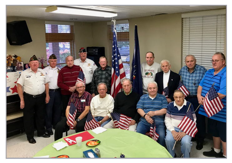
In honor of the many veterans in Lackawanna County, the South Side Active Older Adult Center hosted a Veterans Day pinning ceremony by AseraCare Hospice and Palliative Care Services, as well as a breakfast catered by Sharon's Place.

Through a partnership with the Lackawanna County Area Agency on Aging, UNC operates four active older adult community centers to provide educational, nutritional, and social opportunities to individuals aged 55 and older. Transportation is available to and from all of the centers and lunch is served every weekday. Each center offers different activities, which may include health and educational programs, yoga, arts and crafts, and more.