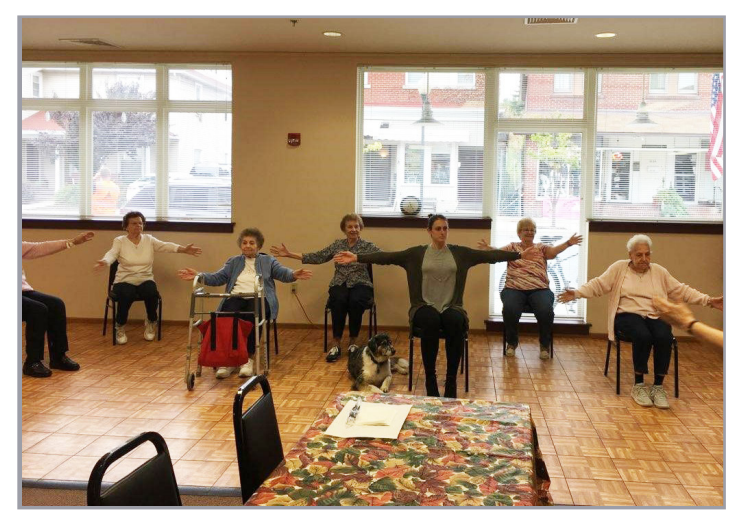
The CHD continues to expand programming to meet the community's growing needs. Chair yoga is one of the ways we encourage our active older adult population to be active without putting them at risk for injury.