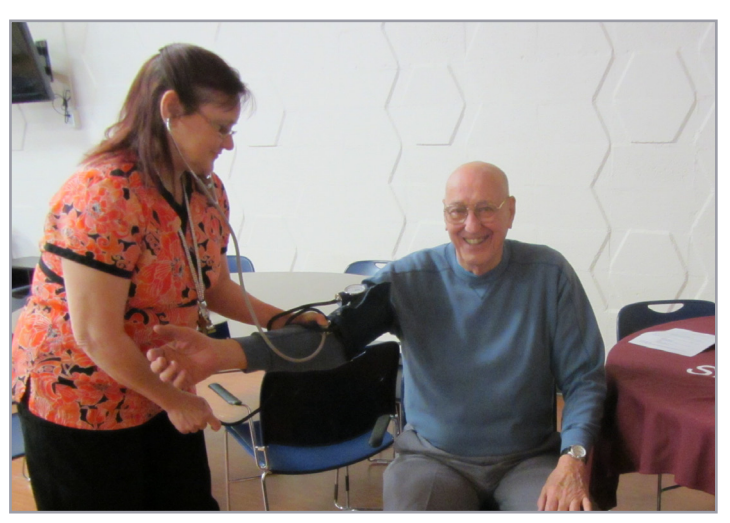
The CHD has been approved through the state of Pennsylvania as a Service Coordination entity for the Medical Assistance Waiver programs. This reimbursement program will allow UNC to expand our services to include more of our community members.