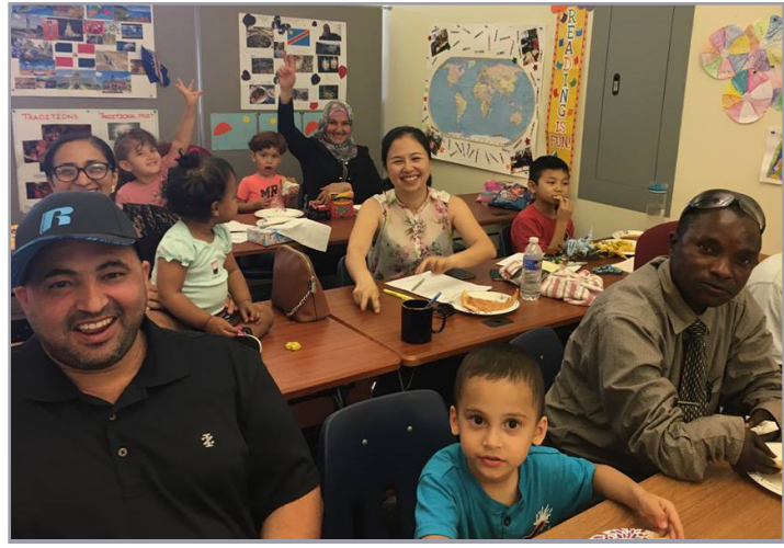
UNC grew the number of families served through our Family Literacy Program. There are now classes in two of the Scranton School District's elementary schools, as well as classes coordinated with Lackawanna County Head Start, allowing parents to join classes immediately after their children start their school day.