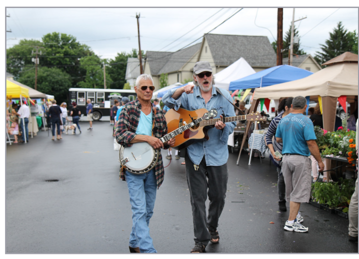
UNC's year-round South Side Farmer's Market has grown, with three new vendors this past year, averaging 200 customers per week. A block party was held to kick off the start of the outdoor market, featuring the music of Jim Cullen and Jackie Bordo, and had about 450 people in attendance.