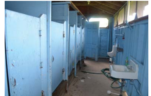
Before and After!