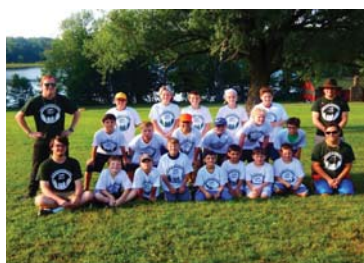
Inaugural Boy's Resident Campers